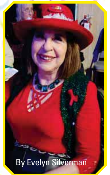
By Evelyn Silverman