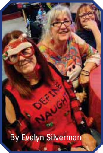
By Evelyn Silverman