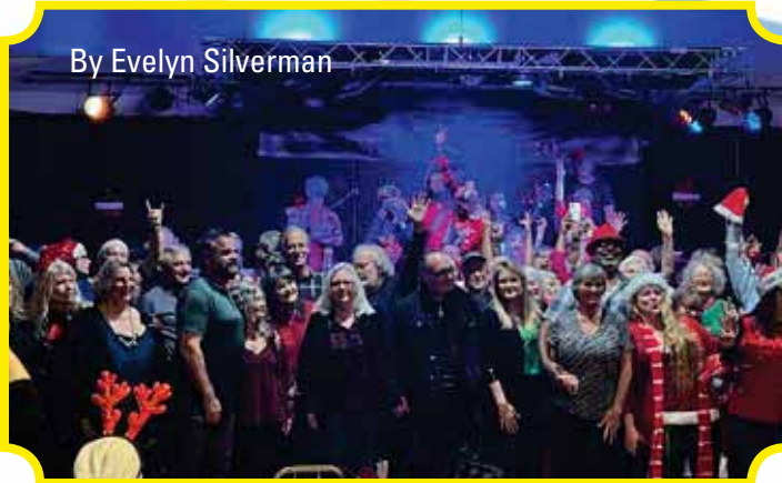
By Evelyn Silverman